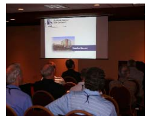
Attendees set their own agenda by selecting from numerous breakout sessions.