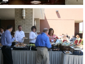
Attendees enjoyed great food, entertainment and beautiful spring weather.