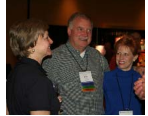
Visualize Success provided tremendous networking opportunities.