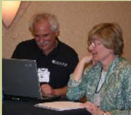
The complimentary one-on-one consulting sessions were a big hit with attendees.