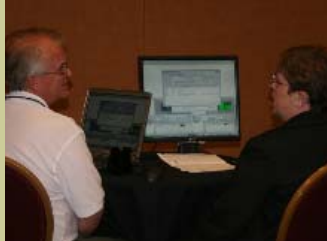
Infor staff provided informative breakout sessions and also ran demos of 6.5.3.