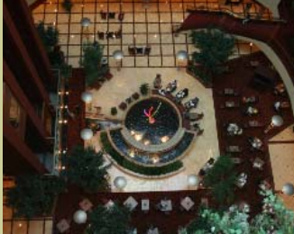
A birds-eye view of the Embassy Suites lobby.